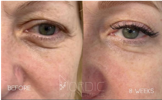
PLASMA FIBROBLAST LOWER EYELIDS + CROWS FEET