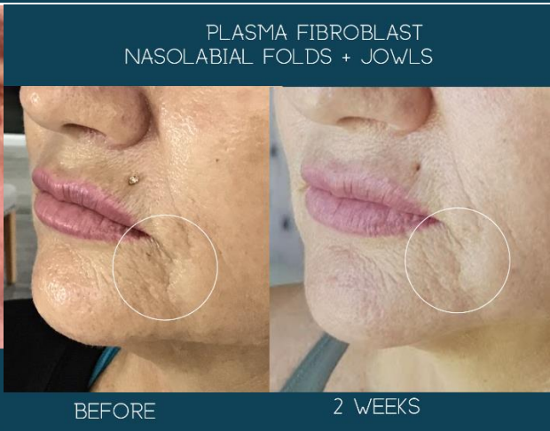
PLASMA FIBROBLAST NASOLABIAL FOLDS + JOWLS