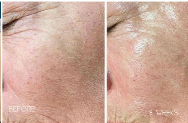
PLASMA FIBROBLAST CROWS FEET