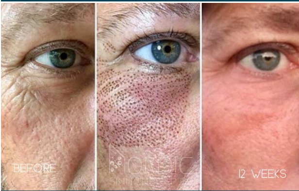
PLASMA FIBROBLAST LOWER EYELID + CROWS FEET