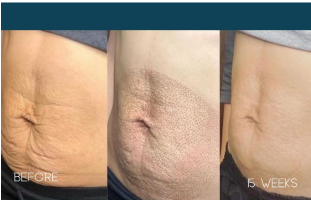
PLASMA FIBROBLAST ABDOMINAL SKIN TIGHTENING